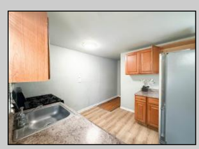
27 Bellevue Ave Atlantic City, NJ 08401