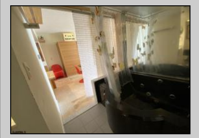
3851 Boardwalk Atlantic City, NJ 08401