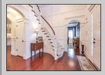
8904 Ventnor Margate, NJ 08402