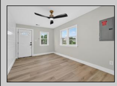
158 Arbor Rd Villas, NJ 08251