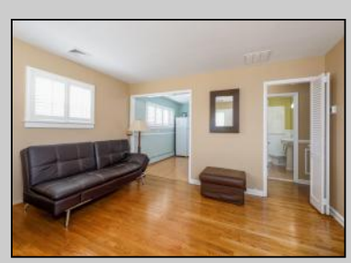
136 11th St S Brigantine, NJ 08203