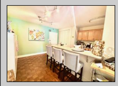
101 Plaza Place Atlantic City, NJ 08401