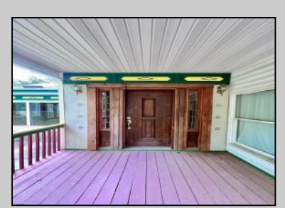
1021 Darmstadt Mullica Township, NJ 08215