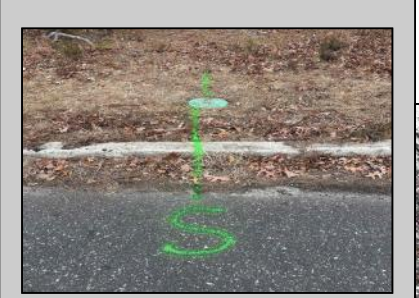
124 Leo Egg Harbor Township, NJ 08234