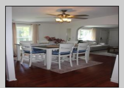
194 Pebble Beach Hamilton Township, NJ 08330