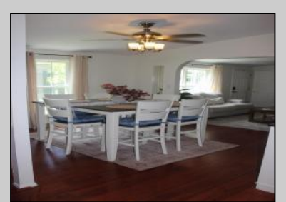
194 Pebble Beach Hamilton Township, NJ 08330