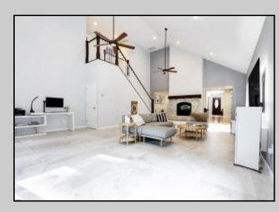
106 Hillside Absecon, NJ 08201