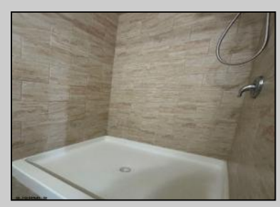
222 39th St So Brigantine, NJ 08203