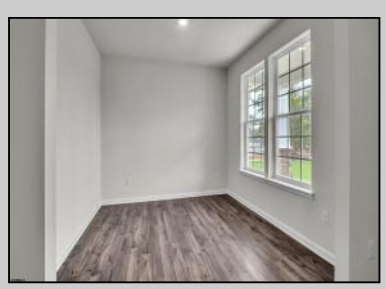
1113 Route 9 Marmora, NJ 08270