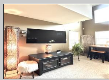
117 New Jersey Atlantic City, NJ 08401