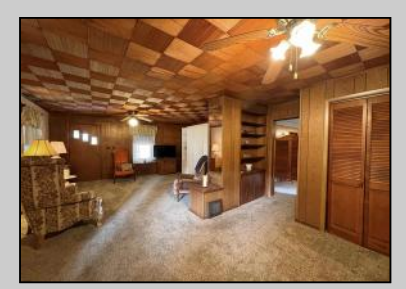
301 Broad Milmay, NJ 08340