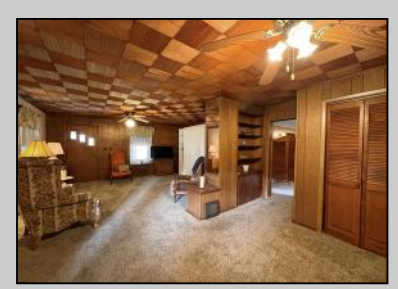
301 Broad Milmay, NJ 08340