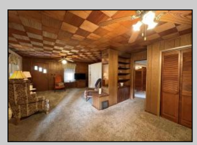
301 Broad Milmay, NJ 08340