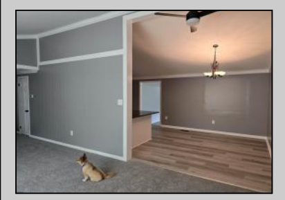
524 Ruth St Buena Vista Township, NJ 08310