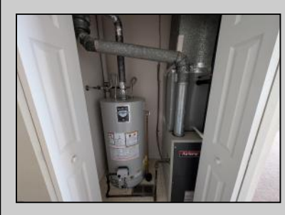
322 Madison Atlantic City, NJ 08401