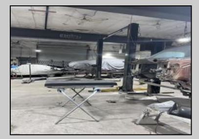
220 White Horse Egg Harbor City, NJ 08215