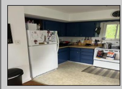
320 Campe Egg Harbor City, NJ 08215