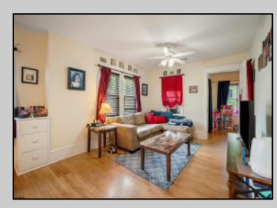
411 Lillian St Absecon, NJ 08201