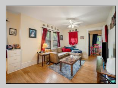
411 Lillian St Absecon, NJ 08201