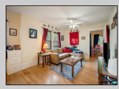
411 Lillian St Absecon, NJ 08201