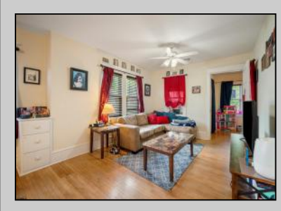
411 Lillian St Absecon, NJ 08201