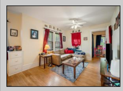
411 Lillian St Absecon, NJ 08201