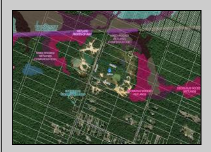
Harbor Mays Landing, NJ 08330