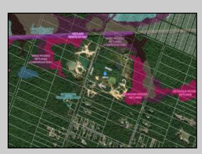
Harbor Mays Landing, NJ 08330