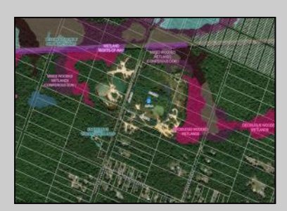
Harbor Mays Landing, NJ 08330