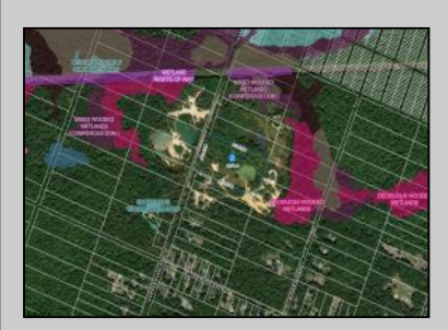
Harbor Mays Landing, NJ 08330