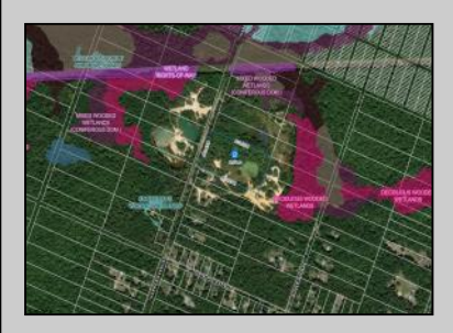
Harbor Mays Landing, NJ 08330