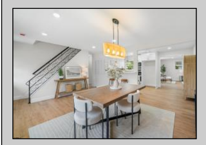
118 Colwick Dr Somers Point, NJ 08244