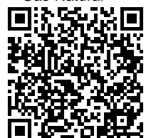
Sewer Public Sewer

AppliancesIncluded Dishwasher Gas Stove Refrigerator Basement Finished Full Inside Entrance Major Appliances Plumbing Heating Baseboard Gas-Natural Sewer Public Sewer