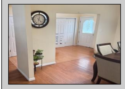
415 Ebony Tree Galloway Township, NJ 08205