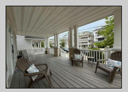
848 3rd Ocean City, NJ 08226