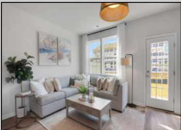
208 Bentz Villas, NJ 08251