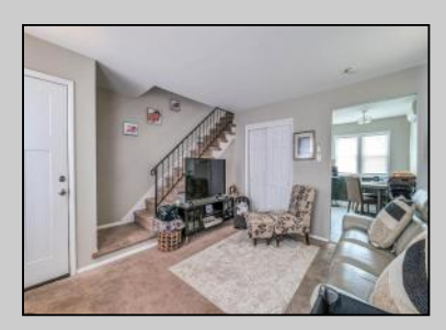
500 New Jersey Somers Point, NJ 08244