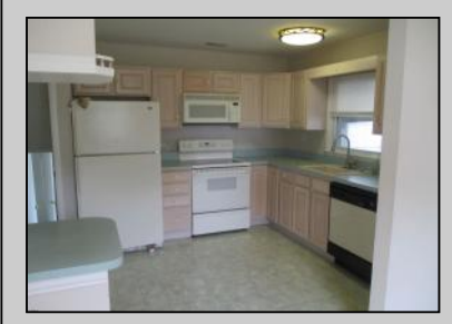
236 Roseann Ave North Cape May, NJ 08204