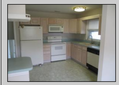
236 Roseann Ave North Cape May, NJ 08204