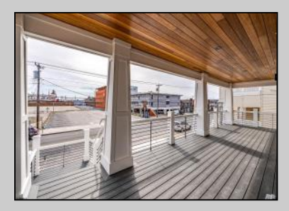
1116 Ocean Ave, Unit #B Ocean City, NJ 08226