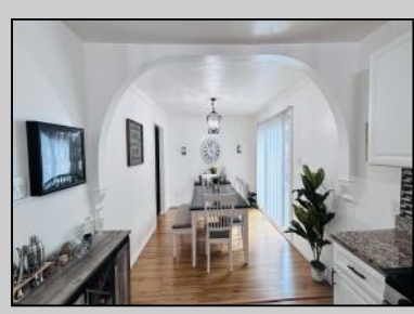
5920 Cedarcroft Dr Mays Landing, NJ 08330