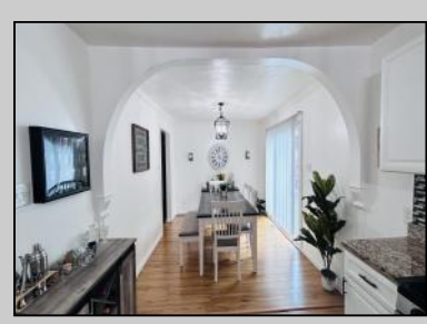
5920 Cedarcroft Dr Mays Landing, NJ 08330