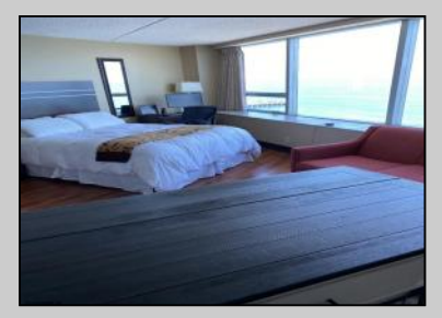
1515 Boardwalk Atlantic City, NJ 08401