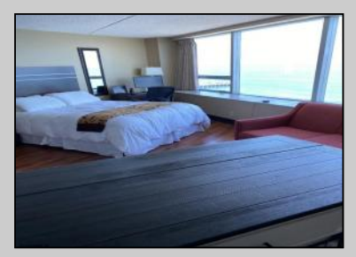
1515 Boardwalk Atlantic City, NJ 08401