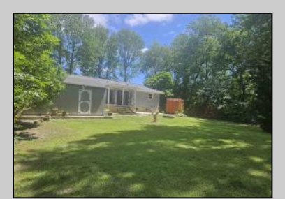
866 Brewster Rd Vineland, NJ 08361