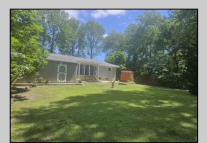
866 Brewster Rd Vineland, NJ 08361