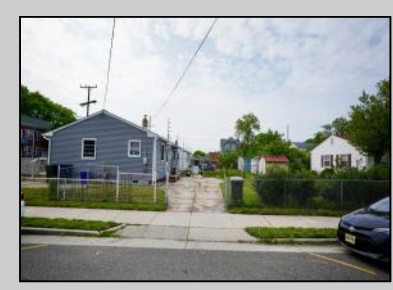
301 Kentucky Ave Atlantic City, NJ 08401