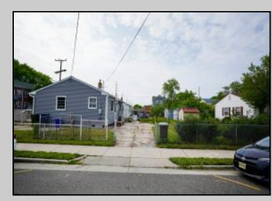
301 Kentucky Ave Atlantic City, NJ 08401