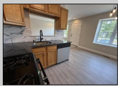
4877 Hawthorne Hamilton Township, NJ 08330