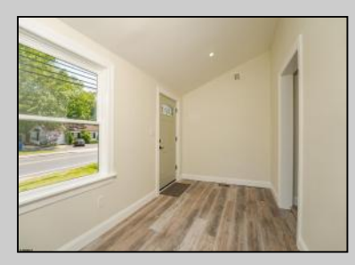
1013 New Rd Northfield, NJ 08225